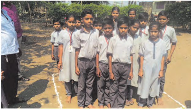
Figure 7.2 : Students carrying out the activity

When the answers to the above questions are negative, then ask all the students to write their observations about the experiment and initiate a discussion on population density in the class.