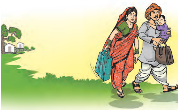
Figure 7.4 : Migration

(Note : In case needed, you can add to this list)